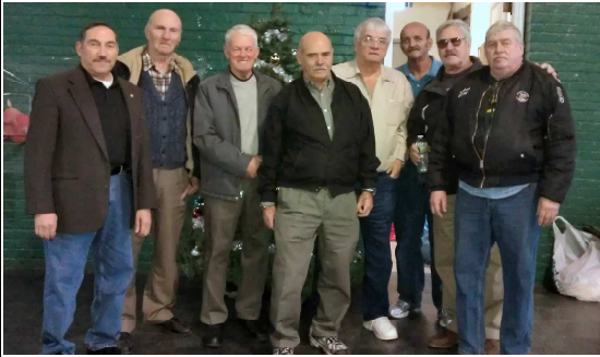
The Old Timers at the Old Yonkers Armory on 1Dec12 attending the 101st ESB Xmas Party