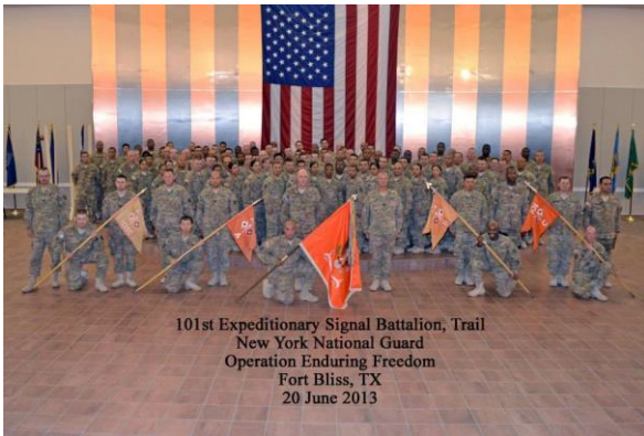
101st Expeditionary Signal Battalion, Trail New York National Guard Operation Enduring Freedom Fort Bliss, TX 20 June 2013