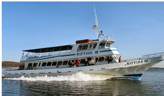
RIPTIDE III 701 Minnieford Avenue City Island, NY

Everyone welcome: Please pass this along