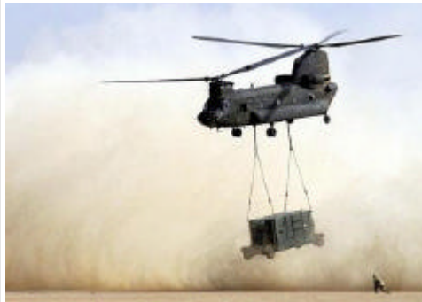
A CH-47 Chinook helicopter with the 101st Airborne Division takes off from Camp New Jersey in Kuwait 2003, carrying communications equipment to be flown into Iraq for the division's Assault Command Post.